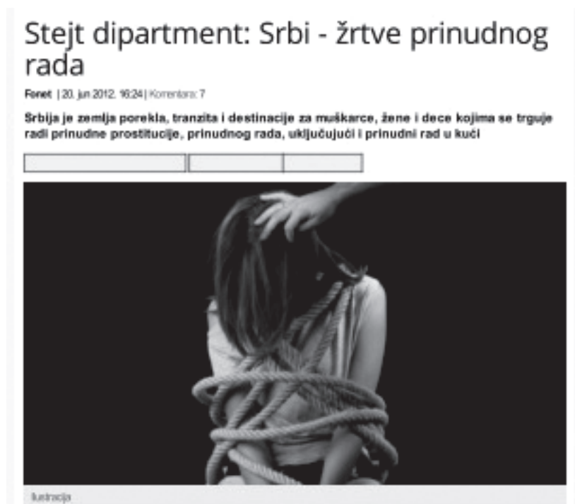
Image 3. Večernje novosti. Title translation: State Department: Serbs—victims of forced labour

in which they must sell sex. In addition, these images use the moral potential of anti-slavery endeavours, which may be interpreted as an attempt to provoke empathic reactions. However, they can also be read as directing the debate back to moral questions of right and wrong. 60 As a result, any response not urging a grand rescue mission is deemed immoral, as is any argument that sex work is a legitimate source of income. By sticking to the binaries of victim and perpetrator, enslaved and free, people and goods, good and evil, nuances between different cases of human trafficking are blurred. Such oversimplification in representing trafficking into the sex industry is particularly dangerous because it may promote inadequate responses to the criminal act, limit support and assistance to trafficked persons who do not fit the stereotype of a helpless white girl, and adversely affect the rights of sex workers and migrant women.