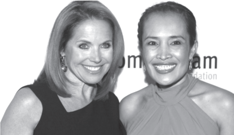
Image 3: Katie Couric and Somaly Mam at a Somaly Mam Foundation Fundraiser