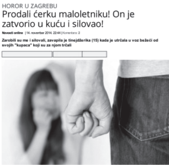
Image 1. Večernje novosti. Title translation: HORROR IN ZAGREB! Underage daughter sold! He locked her in his house and raped her!

When represented in a situation where they are attacked by a male figure, helplessness remains the prevailing motif in portrayals of the powerless victims. We see them held in the firm grip of men's muscular arms. We see clenched fists and belts in the hands of their traffickers that are ready